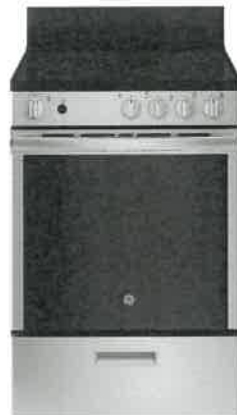
24" Range, Smooth top GE – JCAS640RMSS