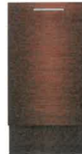
(Panel Ready) UDT518SAHP