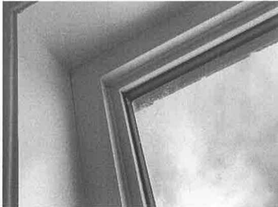
152312 - 1 - WALLS~SCREEN ON WINDOW NOT INSTALLED