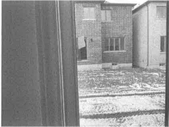
152299 - 1 - WINDOWS~SCRATCH ON UPPER RIGHT FIXED GLASS ABOVE OPERATING AT BED ROOM ABOVE PORCH