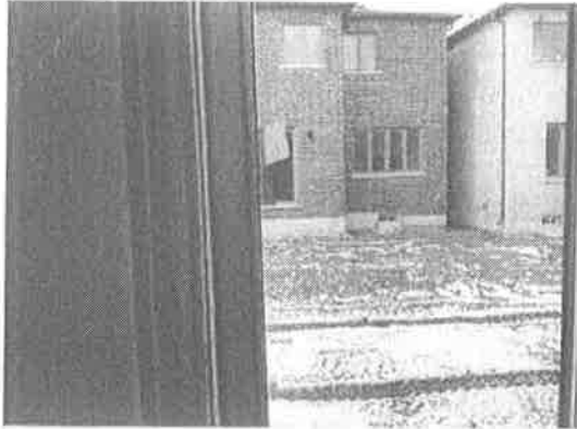
152299 - 1 - WINDOWS~SCRATCH ON UPPER RIGHT FIXED GLASS ABOVE OPERATING AT BED ROOM ABOVE PORCH