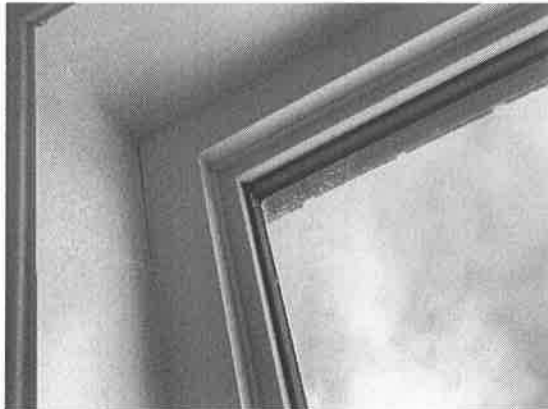
152312 - 1 - WALLS~SCREEN ON WINDOW NOT INSTALLED