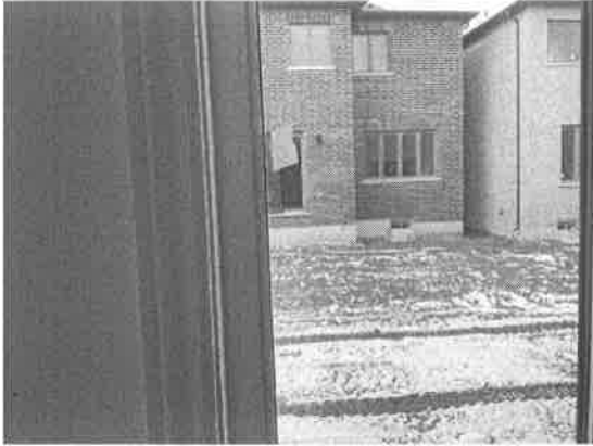
152299 - 1 - WINDOWS~SCRATCH ON UPPER RIGHT FIXED GLASS ABOVE OPERATING AT BED ROOM ABOVE PORCH