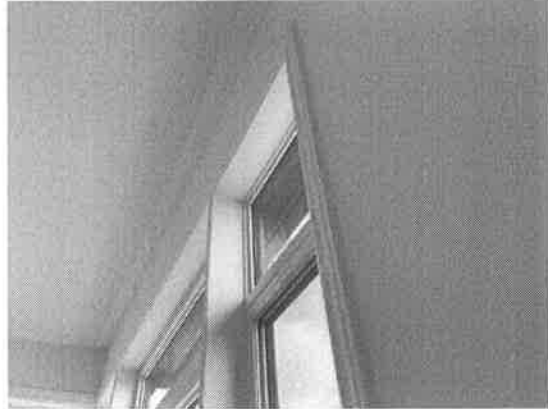
152307 - 1 - WINDOWS~SMALL CHIP AT UPPER LEFT CORNER FIXED WINDOW