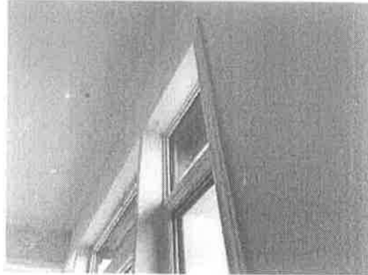
152307 - 1 - WINDOWS~SMALL CHIP AT UPPER LEFT CORNER FIXED WINDOW