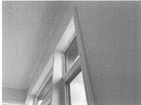
152307 - 1 - WINDOWS~SMALL CHIP AT UPPER LEFT CORNER FIXED WINDOW