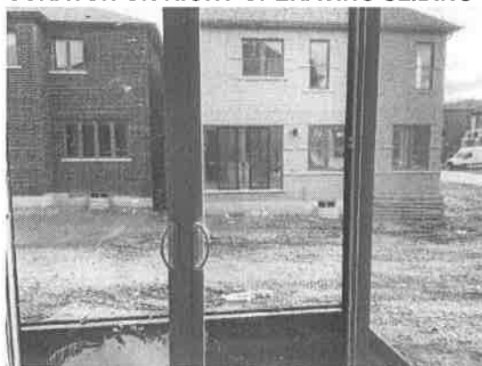
152141 - 1 - NOTE:~ADJUST OPERATING WINDOW IN TOLLET ROOM