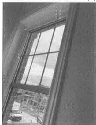
152142 - 1 - NOTE:~SCREEN RIPPED AT OPERATING WINDOW