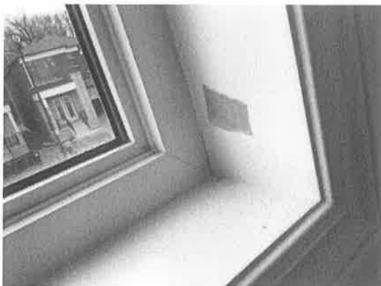
152136 - 1 - WINDOWS~INSPECT GLASS FOR SCRATCH ON RIGHT OPERATING SLIDING DOOR