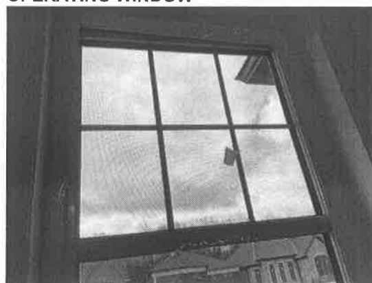
152143 - 1 - NOTE:~ADJUST WINDOW WILL NOT CLOSE