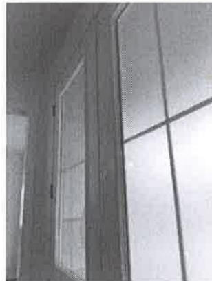
152121 - 1 - WINDOWS~ADJUST OPERATING WINDOW BOWED