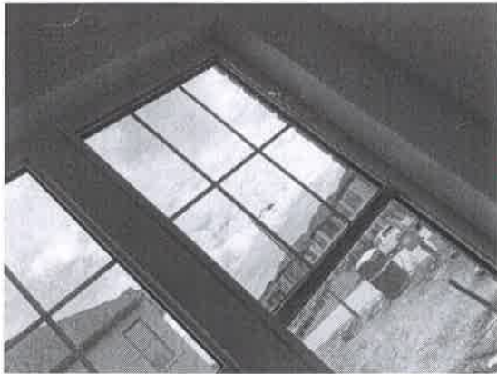
152113 - 1 - FRONT DOORS~INSPECT OPERATING COD OR FOR BOWED