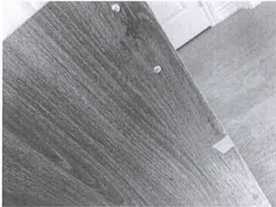
152108 - 1 - WINDOWS~LEFT FIXED WINDOW INSERT FALLING AND INSPECT RIGHT OPERATING WINDOW FOR BEING BOWED