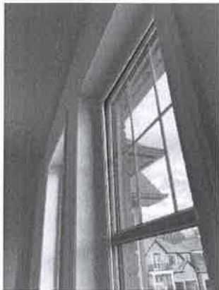
152122 - 1 - WINDOWS~CRACK ON RIGHT FIXED WINDOW MULLIN BOTTOM RIGHT CORNER