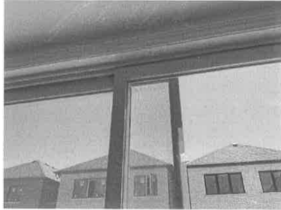
149417 - 1 - PORCH~SCRATCH ON TOP TRIM ABOVE OPERATING DOOR