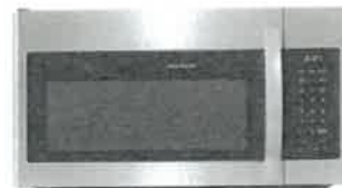
30" Over The Range Microwave Frigidaire FFMV1846VS