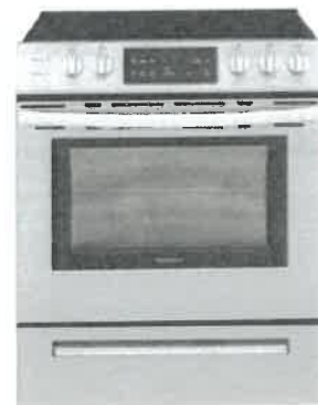
30" Range, Smooth top Frigidaire CFEH3054U