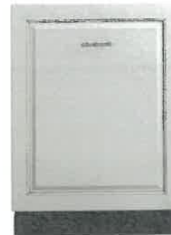
24" Dishwasher (Panel Ready) GBT412SIM1