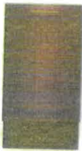
24" Dishwasher (Panel Ready) UDT518SAHP