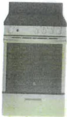
24" Range, Smooth top GE - JCA5640RMSS