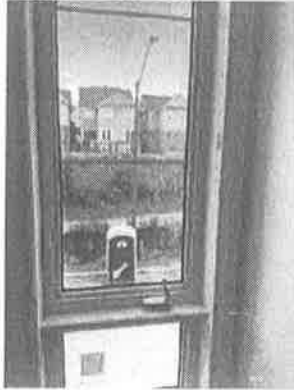
149707 - 1 - WINDOWS~LEFT FIXED WINDOW CRACKED