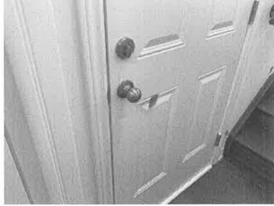
151914 - 1 - GARAGE DOORS~GARAGE TRIM DAMAGED LEFT AND RIGHT SIDE