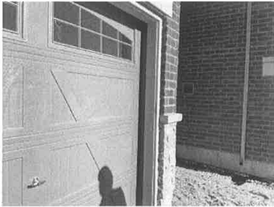
151914 - 2 - GARAGE DOORS~GARAGE TRIM DAMAGED LEFT AND RIGHT SIDE