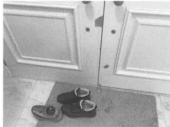
151197 - 1 - NOTE:~CHIPS ON ASTRAGAL AT FRONT DOOR.