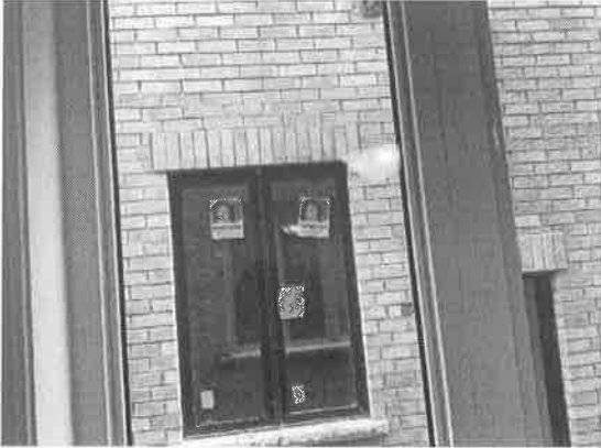
151189 - 1 - NOTE:~DENT ON LEFT SIDE ALUMINUM THRESHOLD AT FRONT DOOR