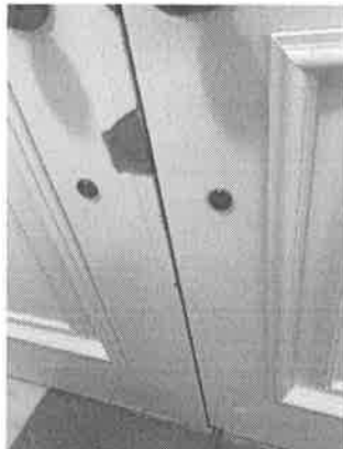
151179 - 1 - WINDOWS~ADJUST OPERATING WINDOW CANNOT OPEN