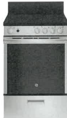
24" Range, Smooth top GE - JCA5640RMSS