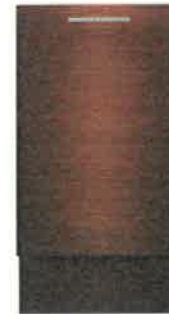
24" Dishwasher (Panel Ready) UDT518SAHP