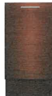
24" Dishwasher (Panel Ready) UDT518SAHP