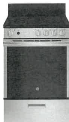
24" Range, Smooth top GE – JCAS640RMSS