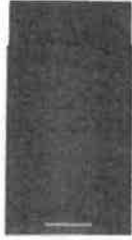
24" Dishwasher (Panel Ready) UDT518SAHP