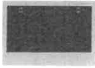
24" Over The Range Microwave Haier HMMV1472BHS