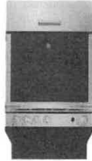
24" Range, Smooth top GE - JCA5640RMSS