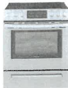
30" Range, Smooth top Frigidaire CFEH30S4U