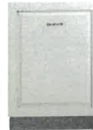
24" Dishwasher (Panel Ready) GBT412SIM1