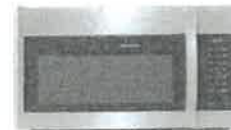
30" Over The Range Microwave Frigidaire FFMV1846VS