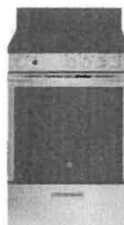
24" Range, Smooth top GE - JCAS640RMSS