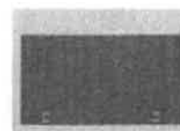
24" Over The Range Microwave Haier HMV1472BHS