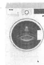
24" Washer WM7200WW