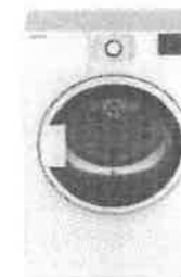
24" Dryer DV7600WW