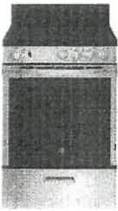
24" Range, Smooth top GE - JCA5640RMSS