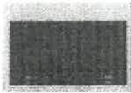
24" Over The Range Microwave Haier HMV1472BHS