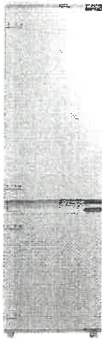
24" Fridge (Panel Ready) GE - M2E9FPMKII