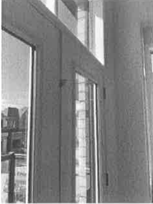
149453 - 1 - FRONT DOORS~RIGHT DOOR BOWED AT TOP