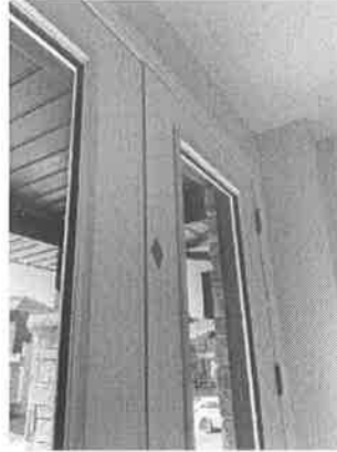
149454 - 1 - STAIRS~ADJUST SIDE ENTRANCE DOOR CAN SEE LIGHT COMING IN