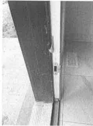
148727 - 1 - WINDOWS~DAMAGED FIXED GLASS RIGHT OF FRONT DOOR