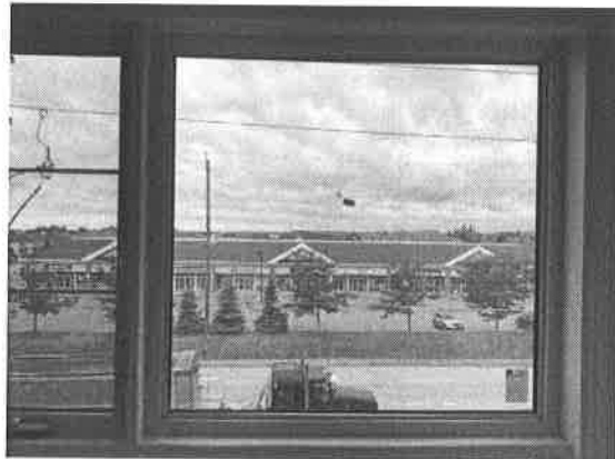
148738 - 1 - WALLS~DAMAGE FIXED WINDOW RIGHT SIDE