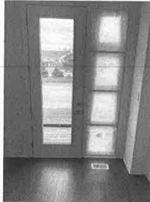
148735 - 1 - WINDOWS~DAMAGED RIGHT FIXED GLASS