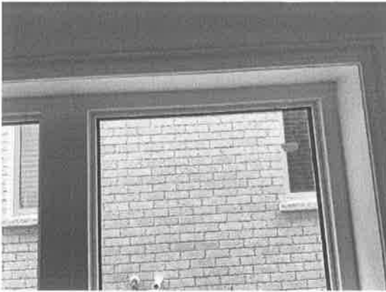
150050 - 1 - WINDOWS~SCREEN DOOR NOT INSTALLED AT SLIDING DOOR