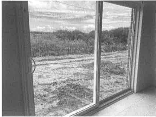
150052 - 1 - FRONT DOORS~LARGE GAP LEFT DOOR