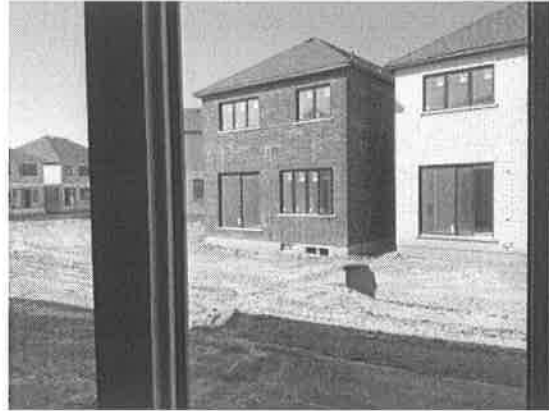
148334 - 2 - WINDOWS~SCRATCH ON RIGHT FIXED GLASS LEFT OF BALCONY DOOR