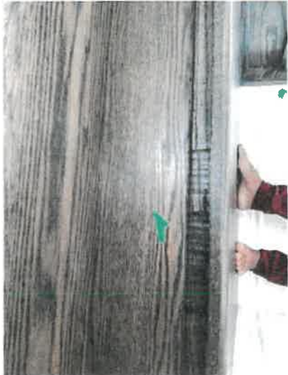
148244 - 1 - STAIRS~DENT ON TRIM RIGHT OF 3RD TREAD AT STAIRS FROM 1ST LANDING TO 2ND FLOOR