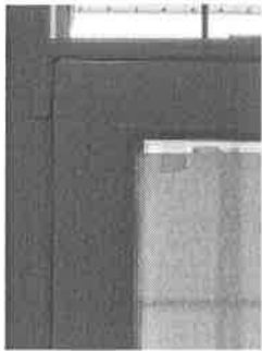
Front door 2.jpg 1060K