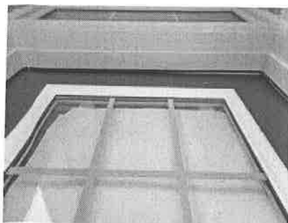
Front door 1.jpg 918K