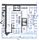
PARTIAL OPTIONAL KITCHEN