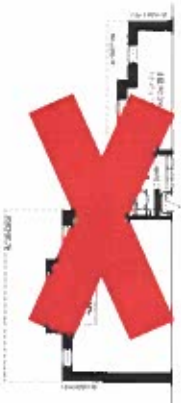
PARTIAL SECOND FLOOR ELEV. B