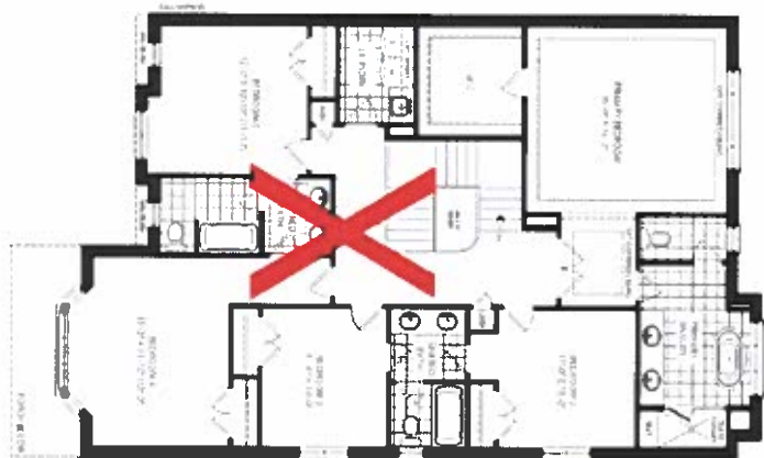
OPTIONAL SECOND FLOOR ELEV. A 5 BEDROOM