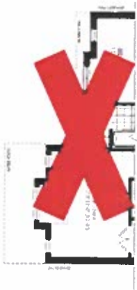
PARTIAL OPTIONAL SECOND FLOOR ELEV. B 5 BEDROOM