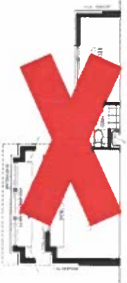
PARTIAL SECOND FLOOR ELEV. C

ALL OF NEWPORT'S ARE SUBJECT TO NEWPORT'S CONSTRUCTION STANDARDS. CONSTRUCTION MAY DIFFER FROM THE USABLE AREA AND SPECIFIED ROOMS. FLOOR PLANS AND ROOMS ARE SUBJECT TO CHANGE WITHOUT NOTICE. EXCEPT WHERE SHOWN OTHERWISE, NEWPORT'S ARE NOT TO BE INCLUDED IN THE BIDDING. PLEASE REFER TO THE REVISION HISTORY AND LOCAL REGULATIONS FOR MORE DETAILS. A. UNDER NO CIRCUMSTANCES SHALL NEWPORT'S BE USED IN ANY MANNER THAT WOULD BE IN VIOLATION OF ANY APPLICABLE LAWS OR REGULATIONS.