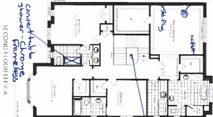
SECOND FLOOR ELEV. A