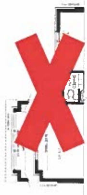
PARTIAL OPTIONAL SECOND FLOOR ELEV. C 5 BEDROOM