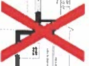
PARTIAL, OPTIONAL SECOND FLOOR ELEV. C. 5 BEDROOM