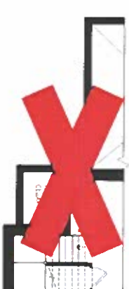
PARTIAL FINISHED BASEMENT FLOOR ELEV. C