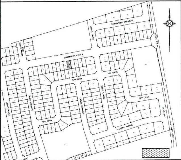
N.T.S. KEY MAP Subject LOT

W Architect Inc. DESIGN CONTROL REVIEW NOVEMBER 19, 2021 FINAL RESITE BY: GGE This stamp is only for the purposes of design control and carries no other professional obligations.