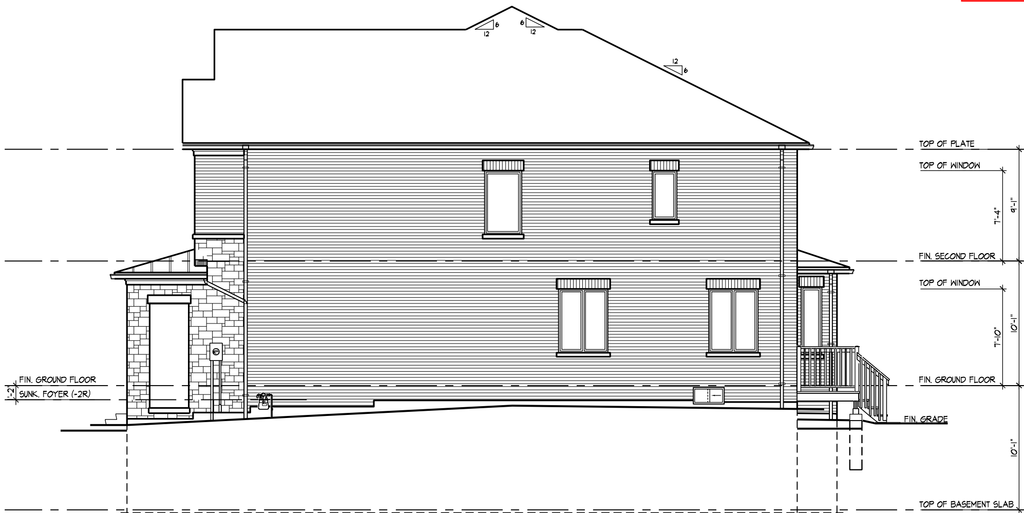
51 2009-END 5 EL. 'A2' (REV)

As per OBC 2012, Div.B, 9.10.14.5(5), projections such as balconies, eaves, stairs, etc., that are more than 1m above grade, shall be non-combustible when within 1.2m of a property line or 2.4m of a combustible projection on another building on the same property.