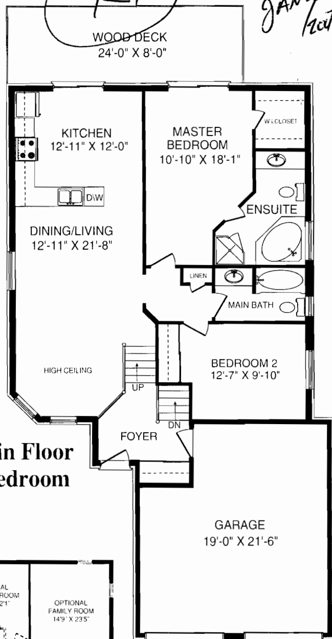
Main Floor 2 Bedroom