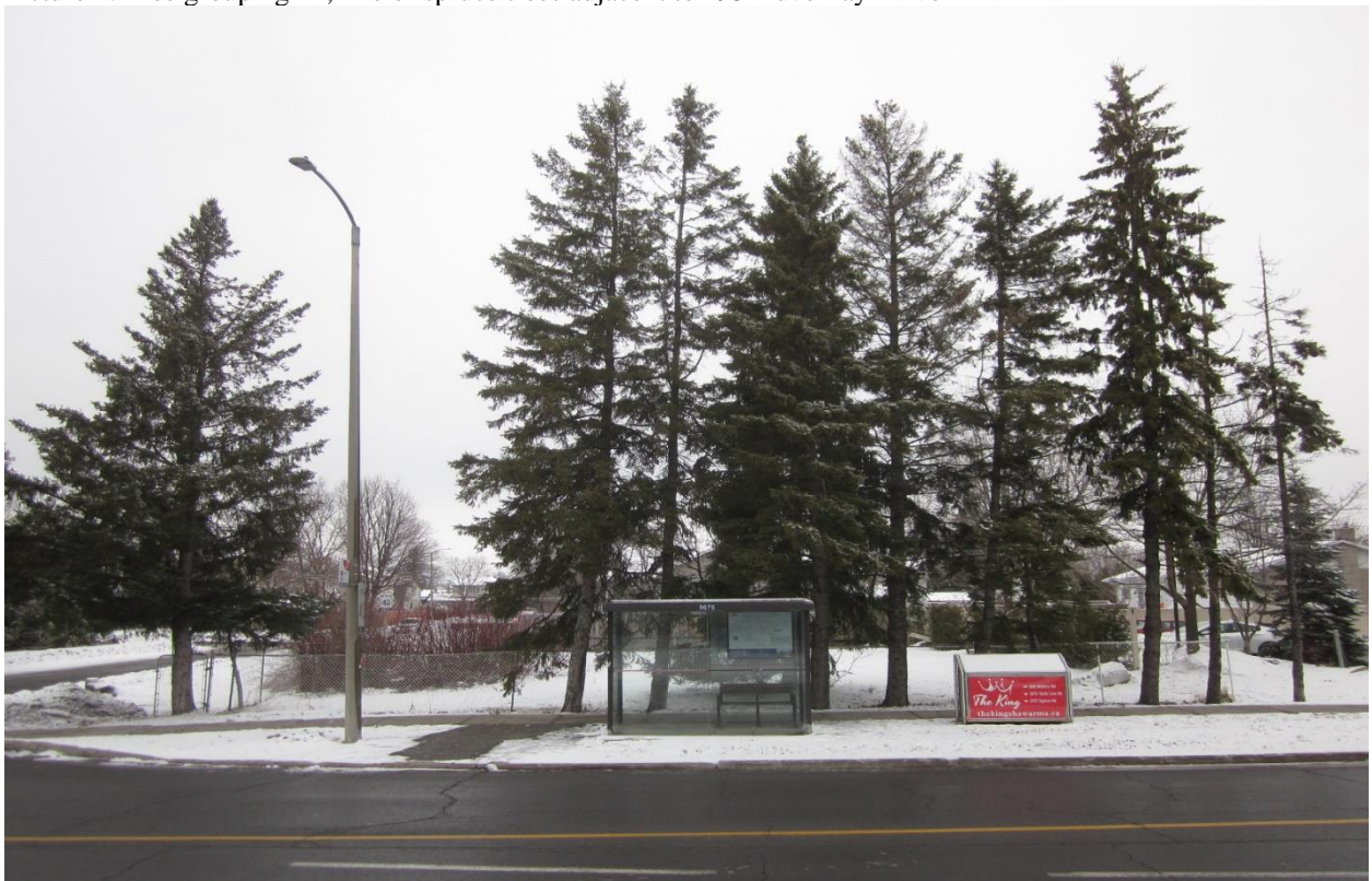
Picture 2. Tree grouping #1, line of spruce trees adjacent to 495 Duvernay Drive