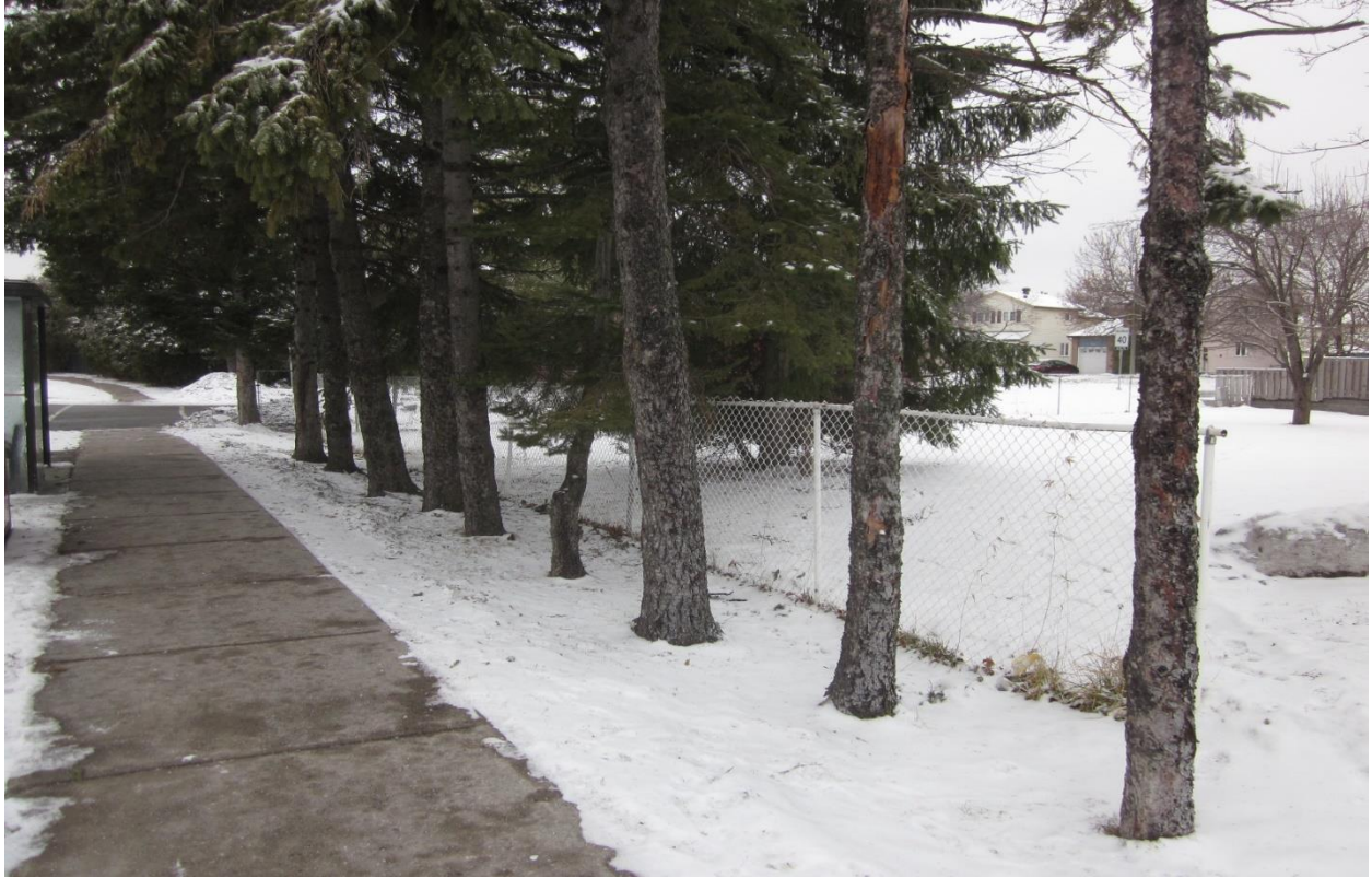
Picture 1. Tree grouping #1, line of spruce trees adjacent to 495 Duvernay Drive