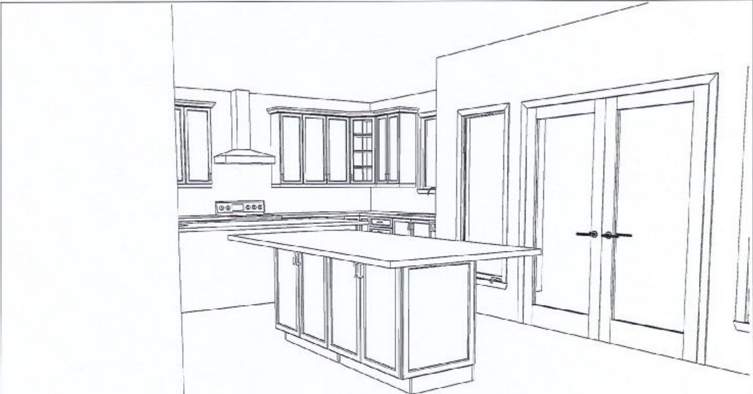
ADDITIONAL ISLAND - BREAKFAST AREA - 3D VIEW #1