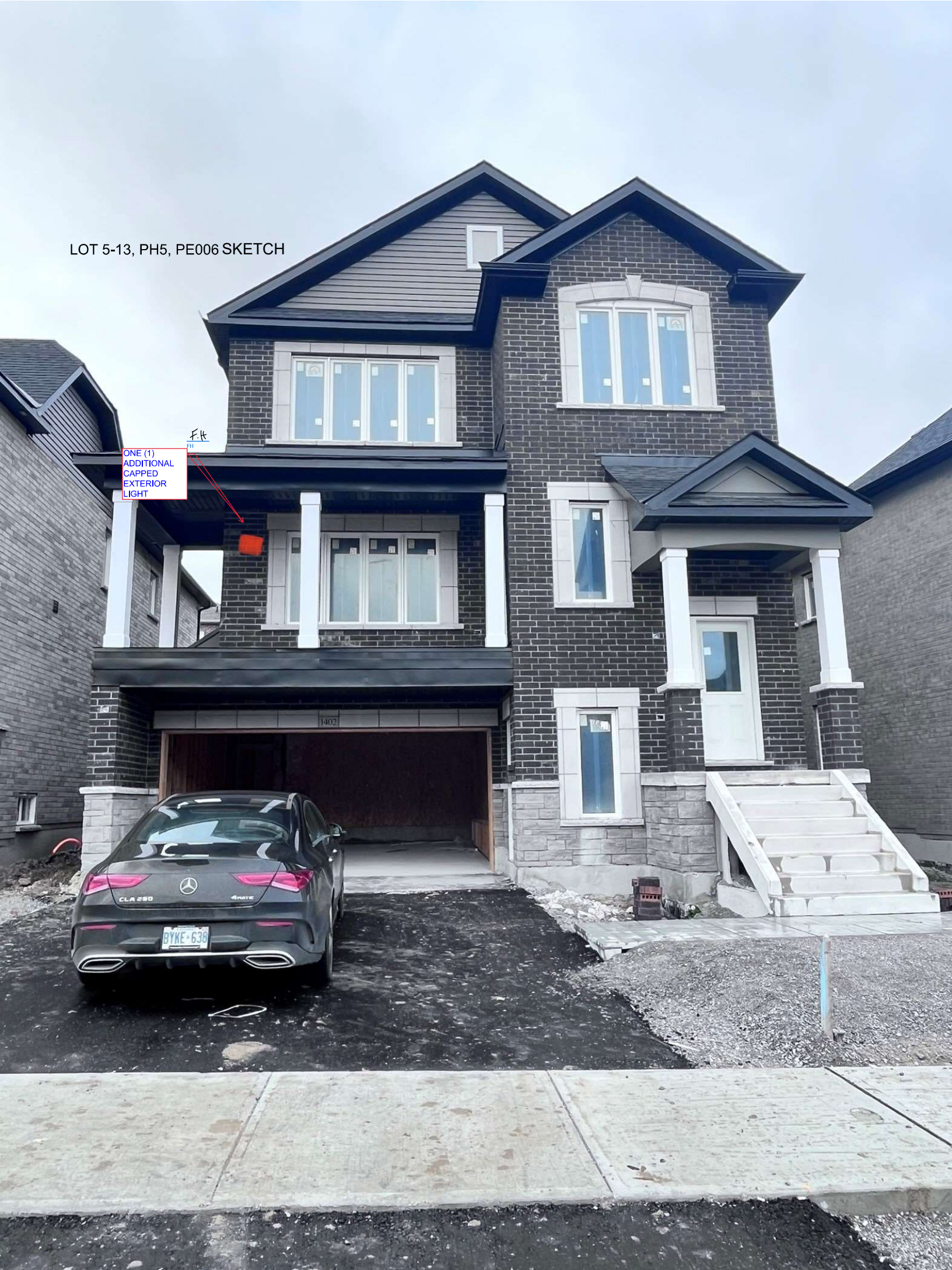
LOT 5-13, PH5, PE006 SKETCH