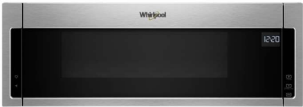
Stainless Steel WML55011HS