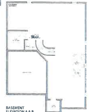
BASEMENT ELEVATION A & B