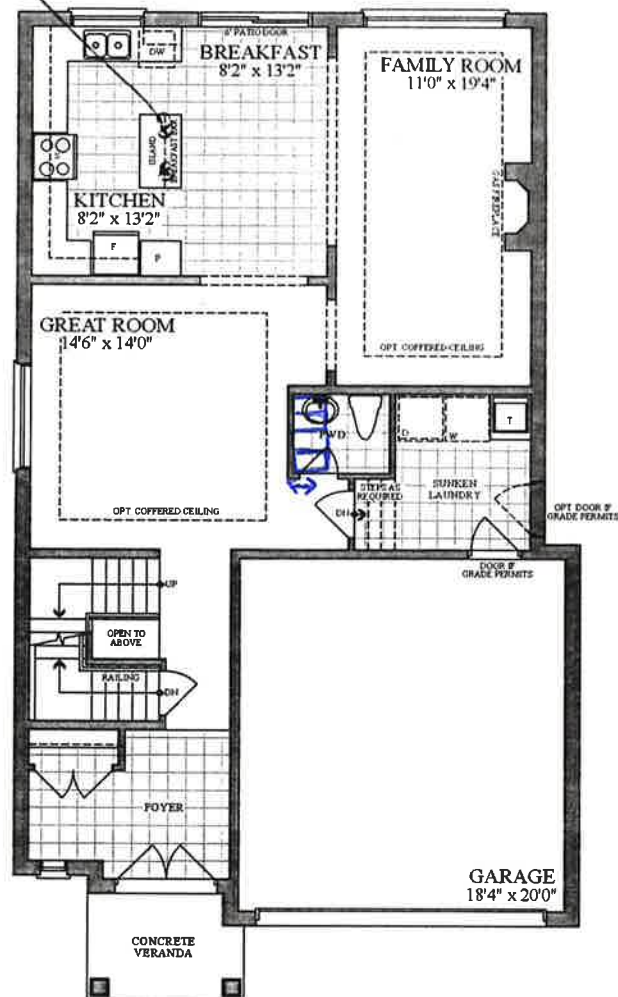
FIRST FLOOR ELEVATION A & B

2 capped Lights for future Pendants LOT 2-21, INNISFIL, PE005