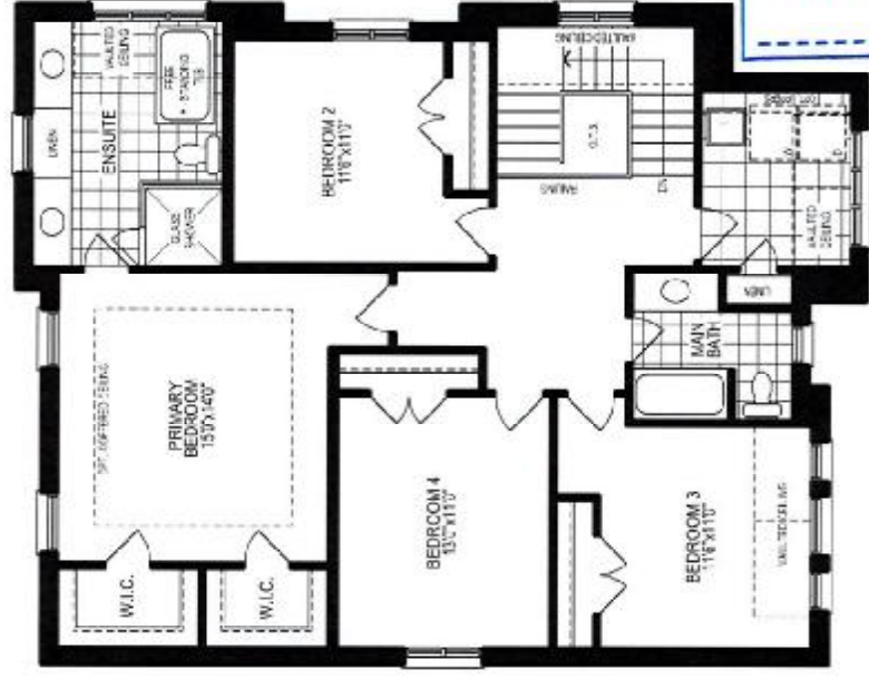
SECOND FLOOR PLAN, EL. "A" - LOT 53