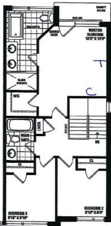
UPPER FLOOR INTERIOR END CONDITION