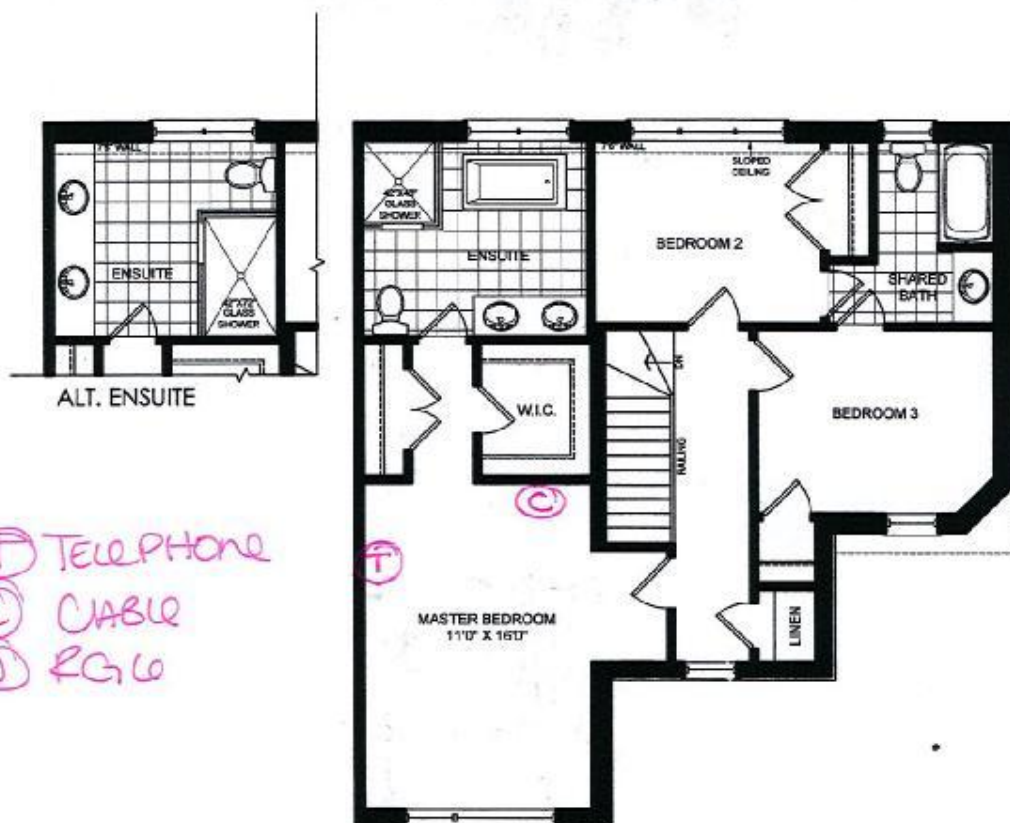
SECOND FLOOR ELEV. 'A'

SENATOR HOMES DECOR CENTRE DATE: Aug. 14TH, 2015 INITIALS: (Signature)