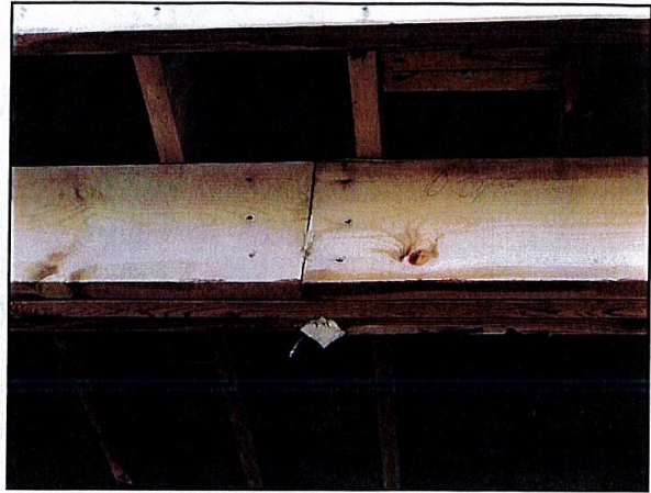
14. Improperly-located splice

Condition: • Columns are not adequately laterally-supported at the top. Nails are prone to pull-out under load. [OBC 9.17.2.2(1)]