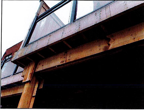
13. Improperly-located splice