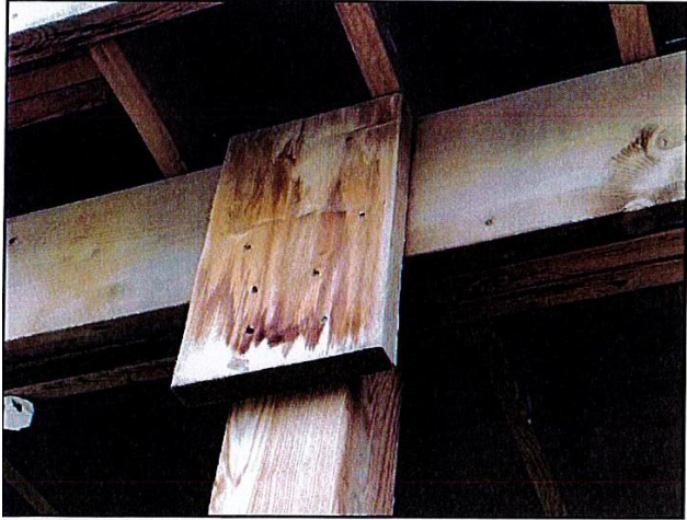
15. Inadequate lateral support