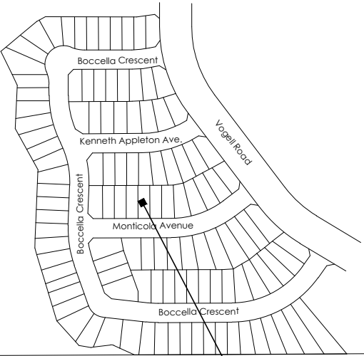
Key Plan not to scale