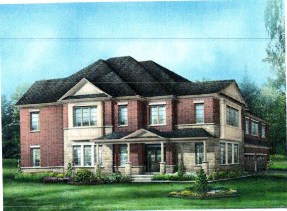
ELEVATION 2 • 3,641 sq.ft.