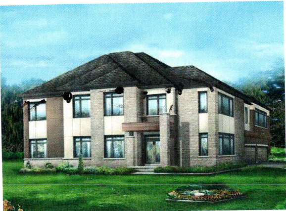
ELEVATION 3 • 3,633 sq.ft.