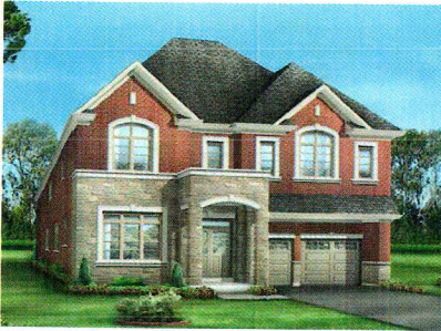
ELEVATION 2 • 3,744 sq.ft.