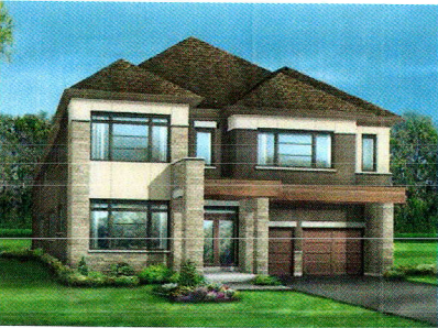
ELEVATION 3 • 3,720 sq.ft.