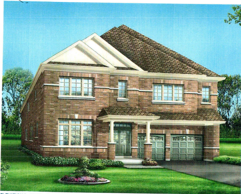
ELEVATION 1 • 3,705 sq.ft.