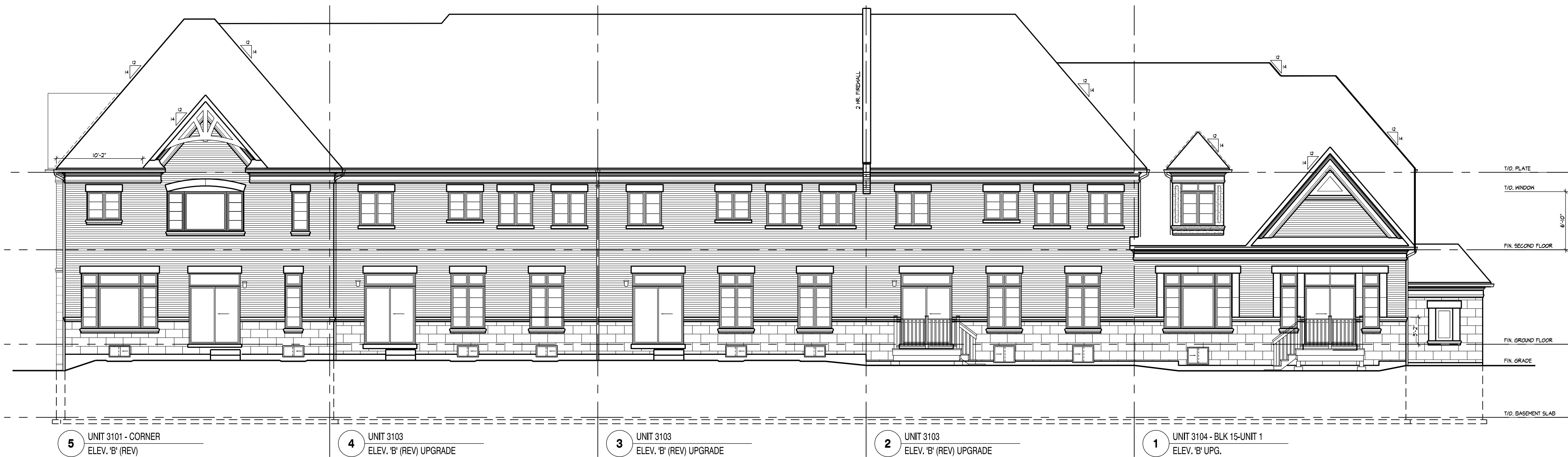
BLOCK 15 - REAR ELEVATION