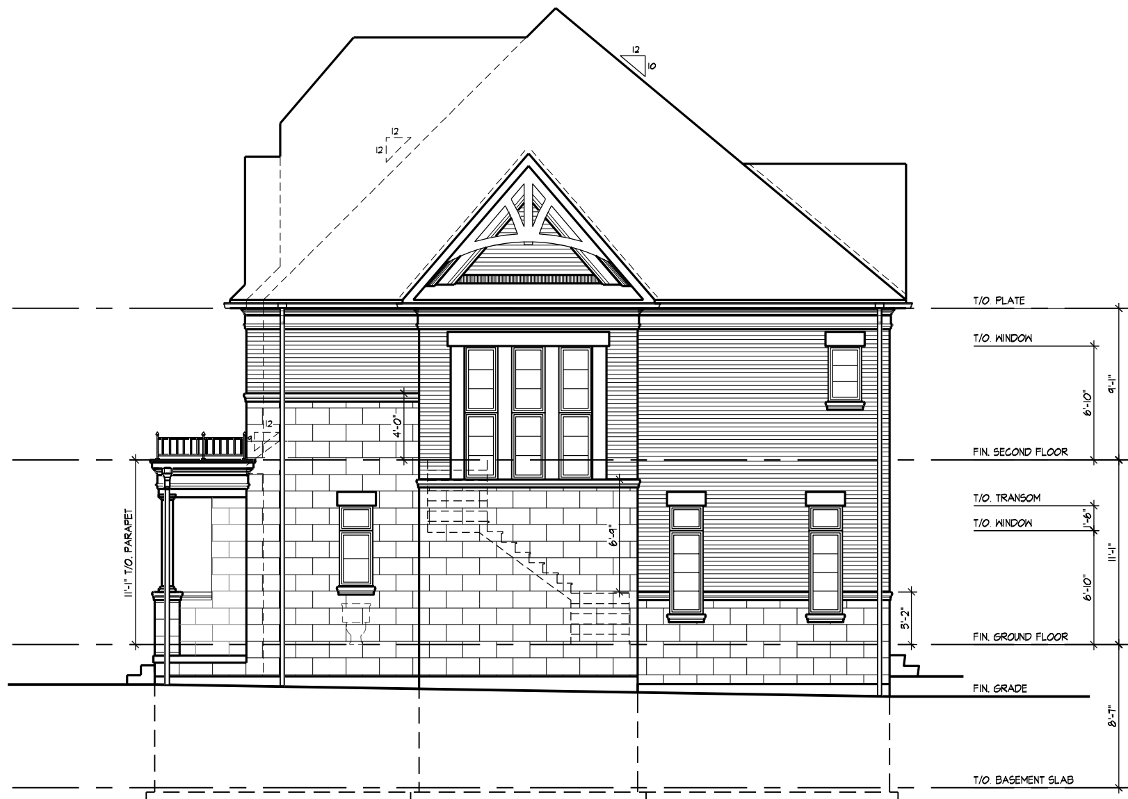
BLOCK 15 - RIGHT SIDE ELEVATION