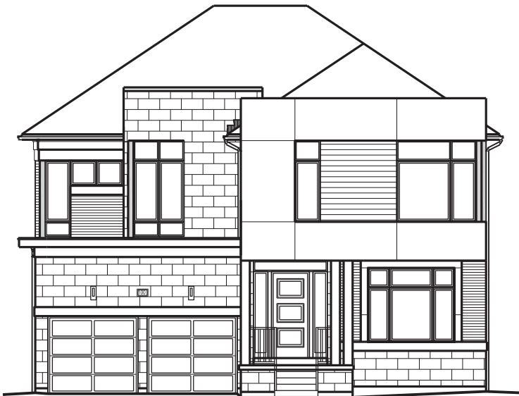
LOT NUMBER: 56 UNIT NAME: KNIGHTSWOOD ELEVATION: C (REV) UNIT NUMBER: 5005