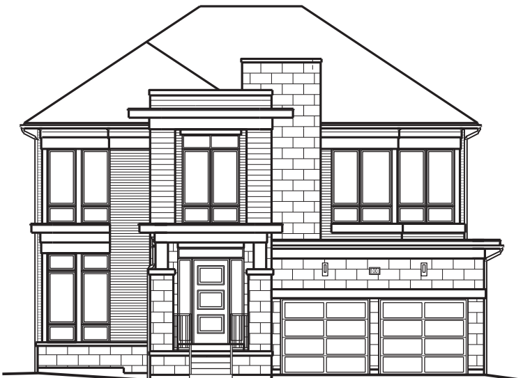
LOT NUMBER: 55 UNIT NAME: OAKGROVE ELEVATION: C UNIT NUMBER: 5003