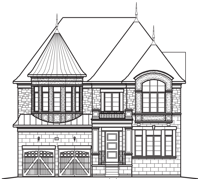
LOT NUMBER: 54 UNIT NAME: KNIGHTSWOOD ELEVATION: B (REV) UNIT NUMBER: 5005

It is the builder's complete responsibility to ensure that all plans submitted for approval fully comply with the Architectural Guidelines and all applicable regulations and requirements including zoning provisions and any provisions in the subdivision agreement. The Control Architect is not responsible in any way for examining or approving site (lotting) plans or working drawings with respect to any zoning or building code or permit matter or that any house can be properly built or located on its lot. This is to certify that these plans comply with the applicable Architectural Design Guidelines approved by the City of VAUGHAN.