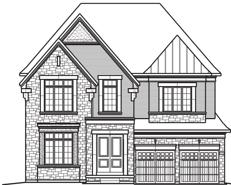
LOT NUMBER: 53 UNIT NAME: ASPEN ELEVATION: A UNIT NUMBER: 5009