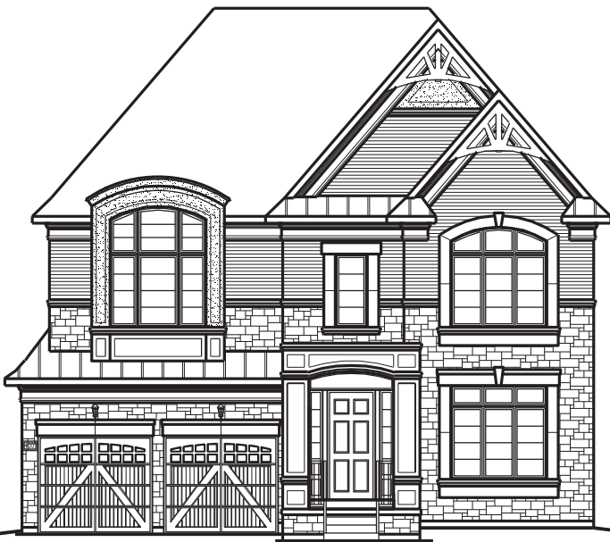
LOT NUMBER: 52 UNIT NAME: ASPEN ELEVATION: B (REV) UNIT NUMBER: 5009