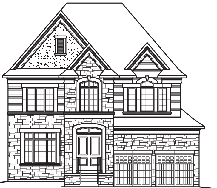
LOT NUMBER: 51 UNIT NAME: BIRCHWOOD ELEVATION: A UNIT NUMBER: 5008