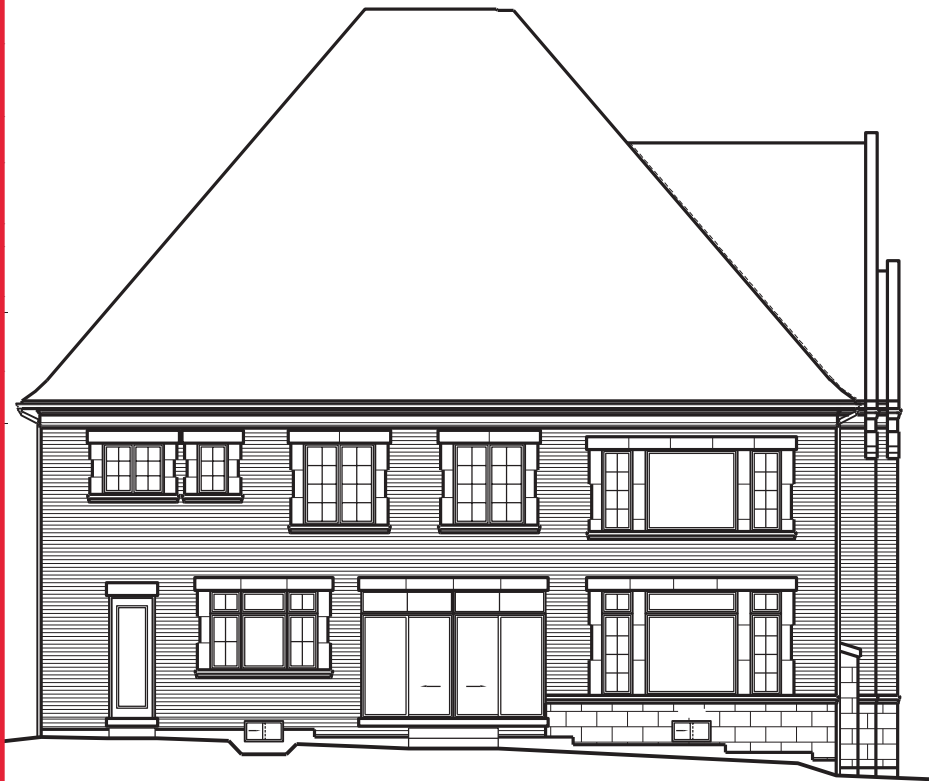
LOT NUMBER: 132 UNIT NAME: KINGSVIEW ELEVATION: A CORNER (REAR) UNIT NUMBER: 6002