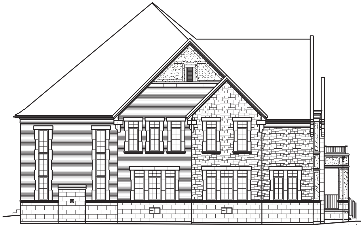
LOT NUMBER: 132 UNIT NAME: KINGSVIEW ELEVATION: A CORNER (FLANKAGE) UNIT NUMBER: 6002