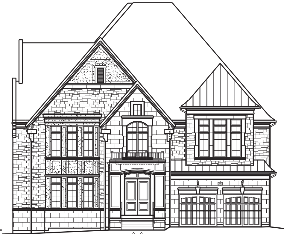
LOT NUMBER: 132 UNIT NAME: KINGSVIEW ELEVATION: A CORNER (FRONT) UNIT NUMBER: 6002