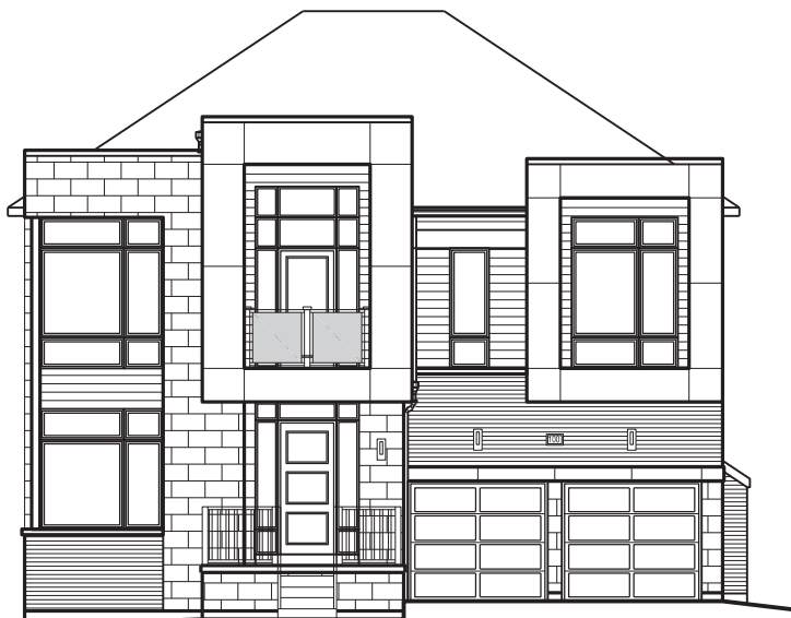
LOT NUMBER: 68 UNIT NAME: THE RIVERVIEW ELEVATION: C UNIT NUMBER: 5013