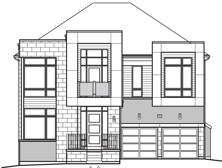
LOT NUMBER: 68 UNIT NAME: THE RIVERVIEW ELEVATION: C UNIT NUMBER: 5013