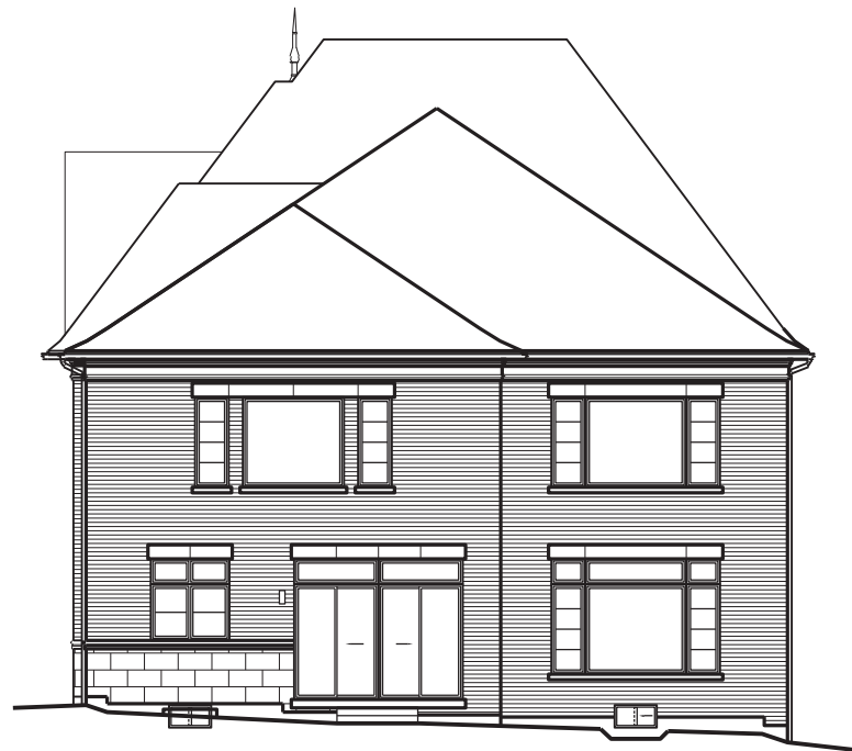
LOT NUMBER: 67 UNIT NAME: TIMBERLAND ELEVATION: B CORNER REAR UNIT NUMBER: 5011-MOD-LOT 67