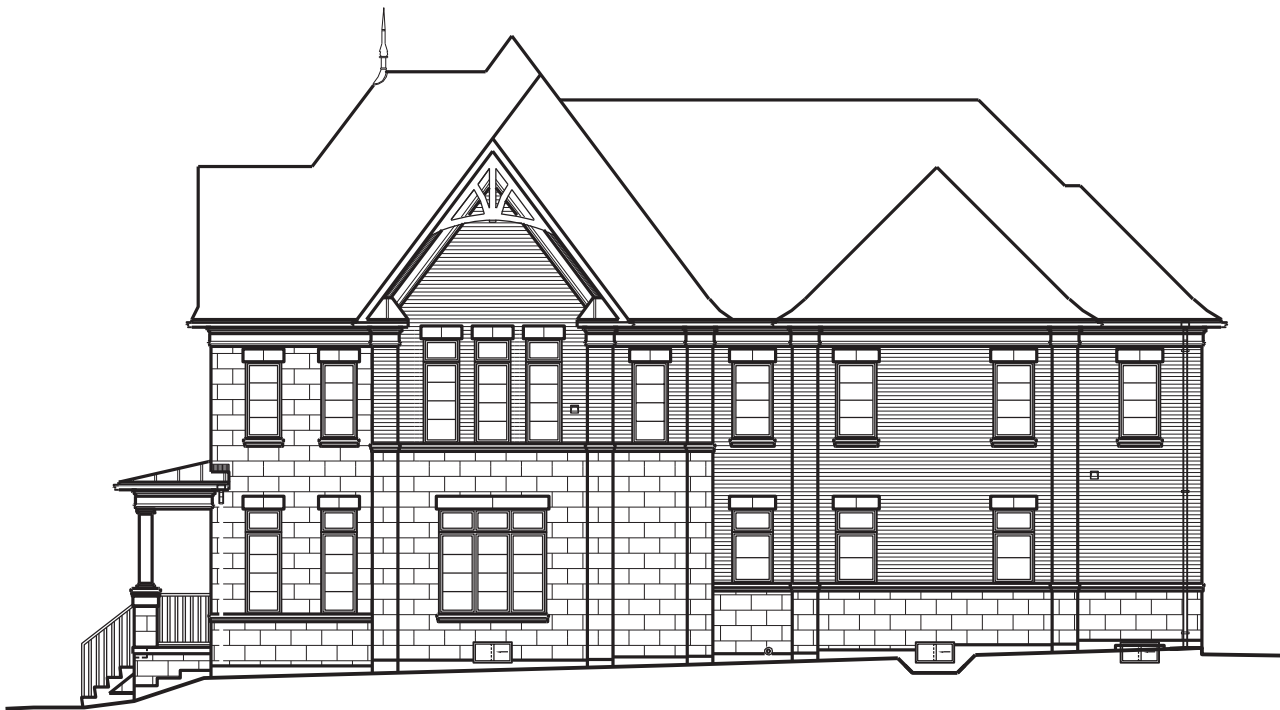
LOT NUMBER: 67 UNIT NAME: TIMBERLAND ELEVATION: B CORNER FLANKAGE UNIT NUMBER: 5011-MOD-LOT 67