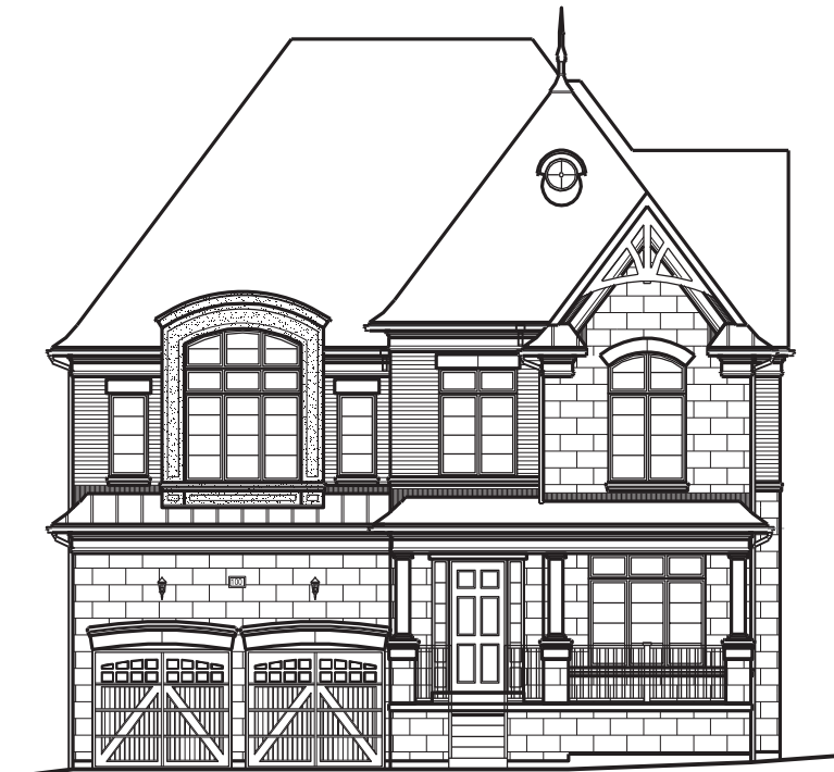
LOT NUMBER: 67 UNIT NAME: TIMBERLAND ELEVATION: B CORNER FRONT UNIT NUMBER: 5011-MOD-LOT 67