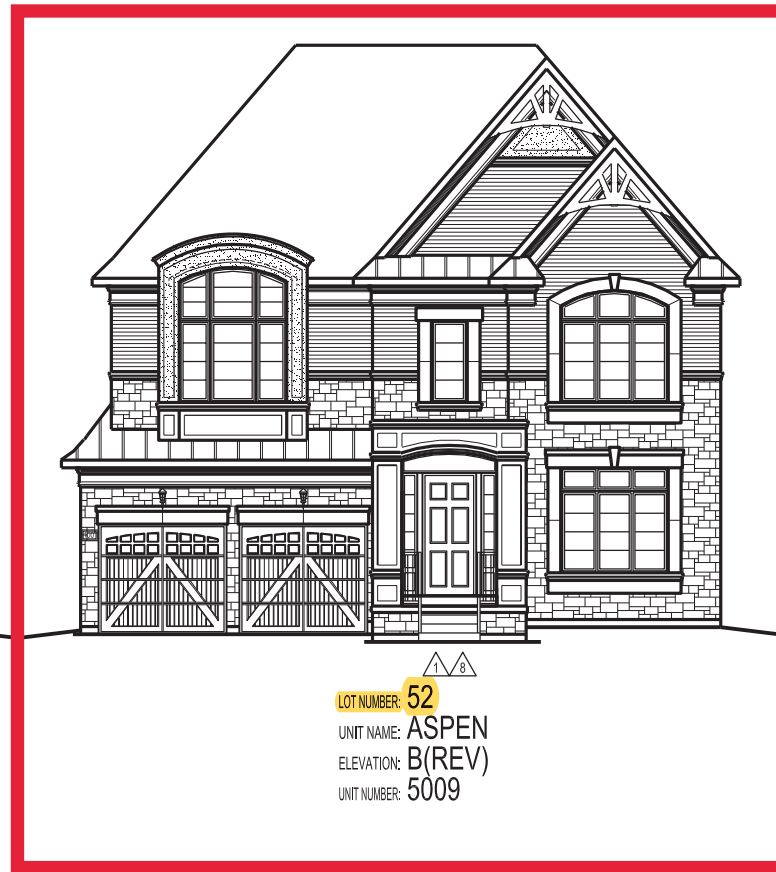
LOT NUMBER: 52 UNIT NAME: ASPEN ELEVATION: B(REV) UNIT NUMBER: 5009