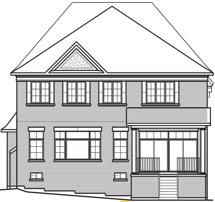
LOT NUMBER: 53 UNIT NAME: ASPEN ELEVATION: REAR A UPG. UNIT NUMBER: 5009