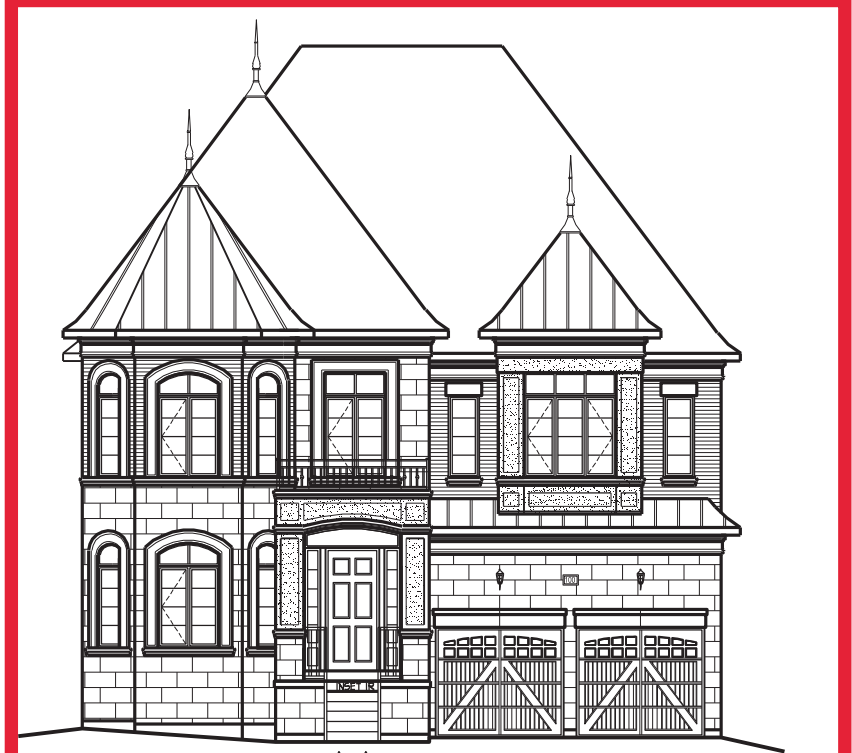
△/△ LOT NUMBER: 31 UNIT NAME: WILLOWCREEK ELEVATION: B UNIT NUMBER: 5012