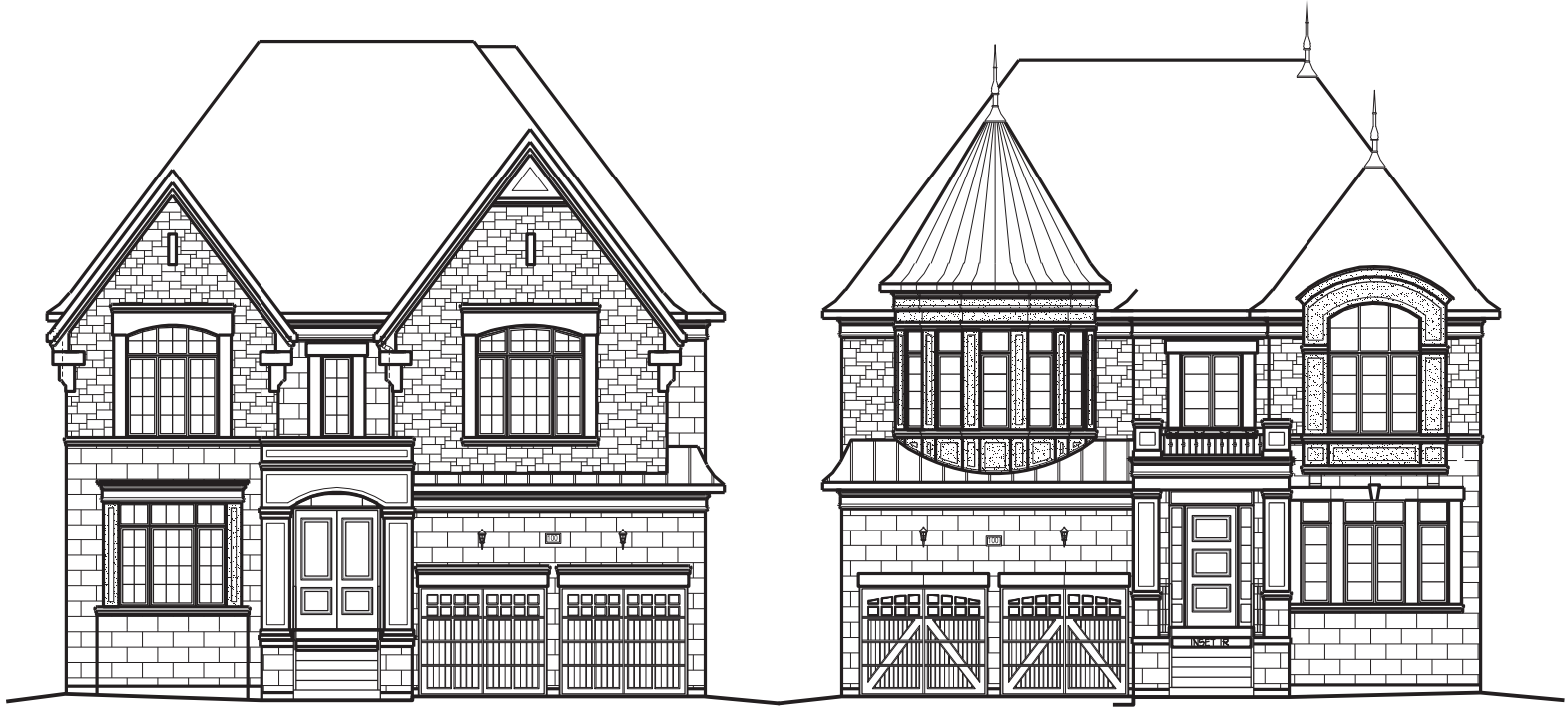
△/△ LOT NUMBER: 33 UNIT NAME: KNIGHTSWOOD ELEVATION: A UNIT NUMBER: 5005-OPT.