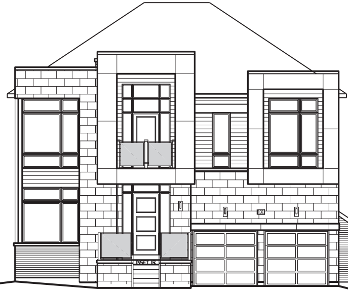
△/△ LOT NUMBER: 28 UNIT NAME: RIVERVIEW ELEVATION: C UNIT NUMBER: 5013