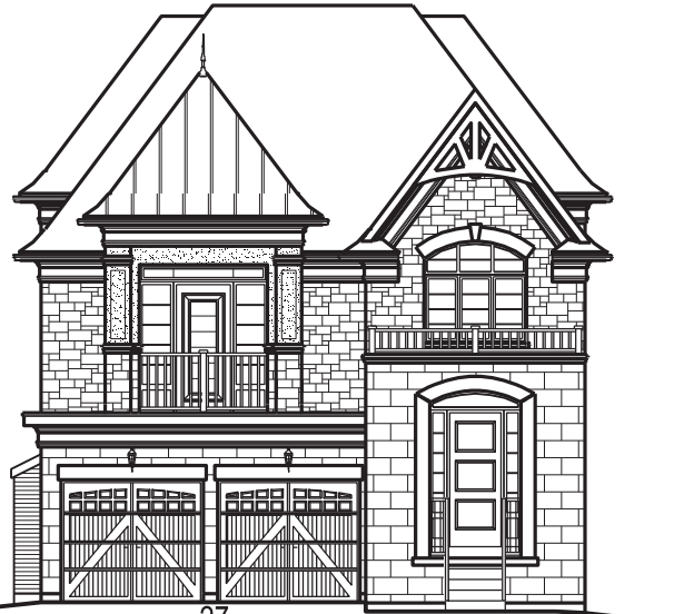
△/△ LOT NUMBER: 27 UNIT NAME: BROOKSIDE ELEVATION: B (REV.) UNIT NUMBER: 4003