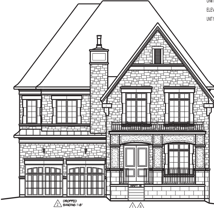
△/△ LOT NUMBER: 30 UNIT NAME: TIMBERLAND ELEVATION: A (REV.) UNIT NUMBER: 5011