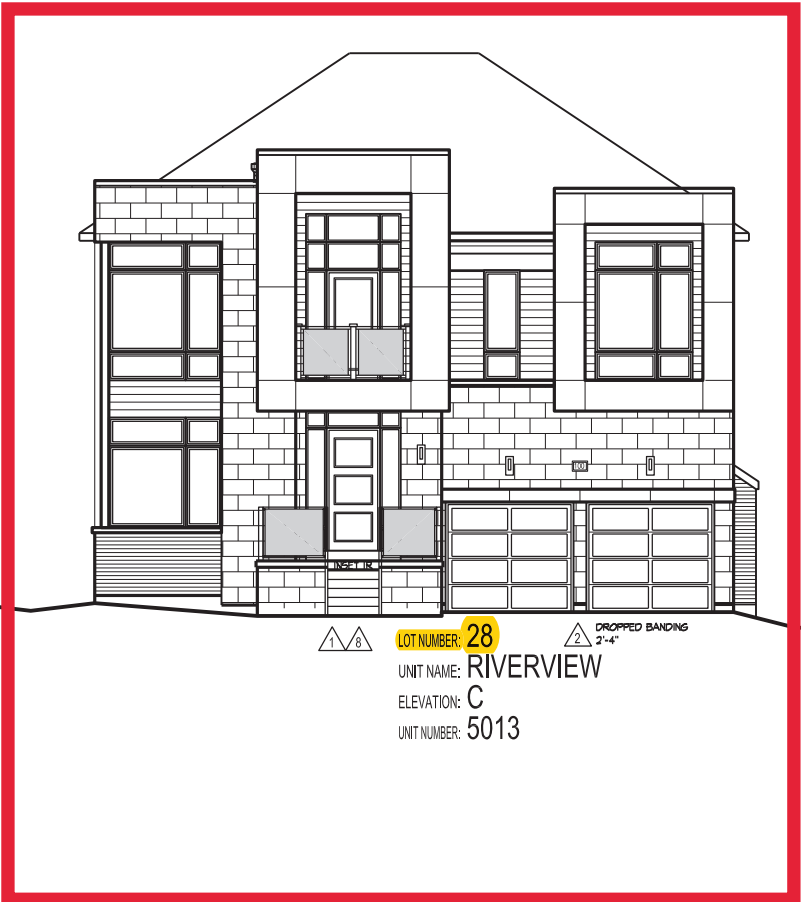
1/8 LOT NUMBER: 28 UNIT NAME: RIVERVIEW ELEVATION: C UNIT NUMBER: 5013