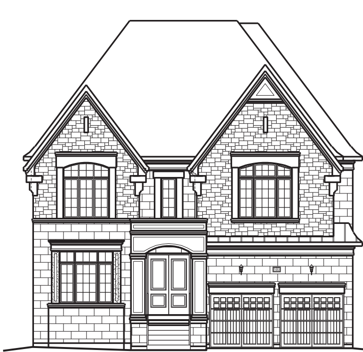
1/8 LOT NUMBER: 33 UNIT NAME: KNIGHTSWOOD ELEVATION: A UNIT NUMBER: 5005-OPT.