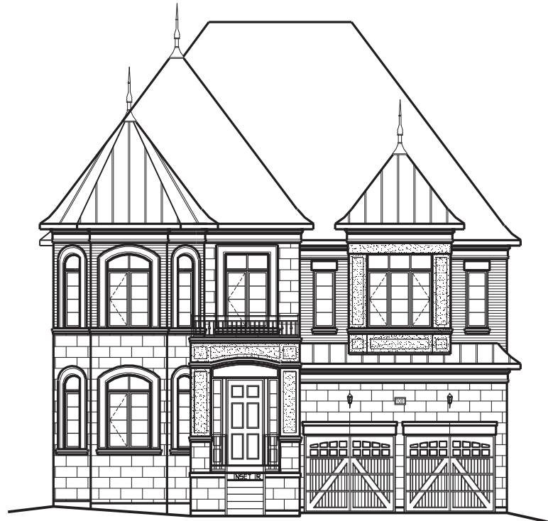
1/8 LOT NUMBER: 31 UNIT NAME: WILLOWCREEK ELEVATION: B UNIT NUMBER: 5012