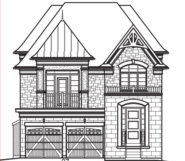
1/8 LOT NUMBER: 27 UNIT NAME: BROOKSIDE ELEVATION: B (REV.) UNIT NUMBER: 4003