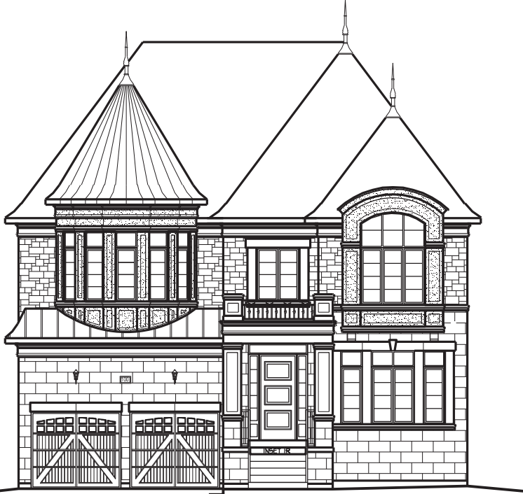
1/8 LOT NUMBER: 32 UNIT NAME: KNIGHTSWOOD ELEVATION: B (REV.) UNIT NUMBER: 5005-OPT.