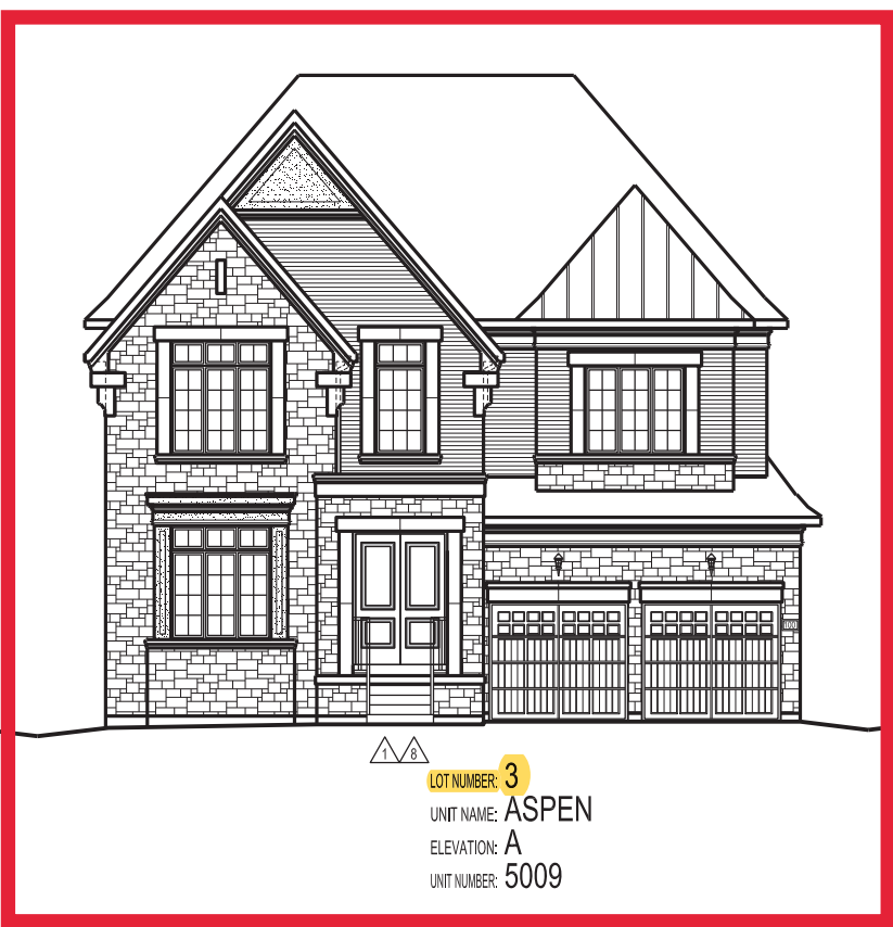
LOT NUMBER: 3 UNIT NAME: ASPEN ELEVATION: A UNIT NUMBER: 5009