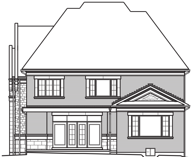
LOT NUMBER: 1 UNIT NAME: THE BEAUMONT ELEVATION: A CORNER REAR-LOGGIA(REV) UNIT NUMBER: 5004

It is the builder's complete responsibility to ensure that all plans submitted for approval fully comply with the Architectural Guidelines and all applicable regulations and requirements including zoning provisions and any provisions in the subdivision agreement. The Control Architect is not responsible in any way for examining or approving site (lotting) plans or working drawings with respect to any zoning or building code or permit matter or that any house can be properly built or located on its lot. This is to certify that these plans comply with the applicable Architectural Design Guidelines approved by the City of VAUGHAN.