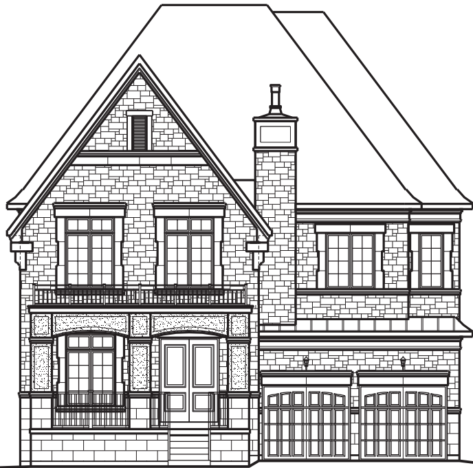
LOT NUMBER: 4 UNIT NAME: TIMBERLAND ELEVATION: A UNIT NUMBER: 5011