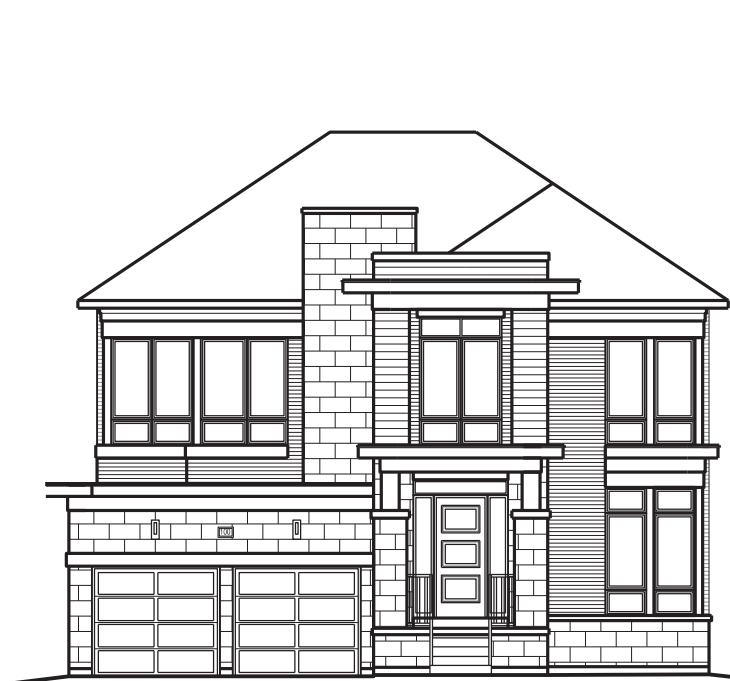
LOT NUMBER: 5 UNIT NAME: OAKGROVE ELEVATION: C(REV) UNIT NUMBER: 5003