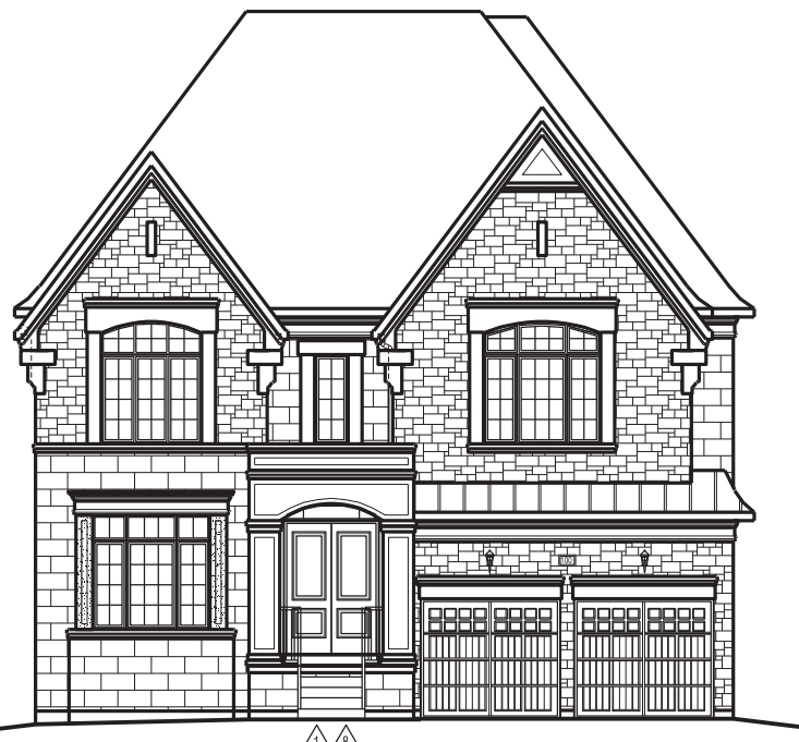
LOT NUMBER: 2 UNIT NAME: KNIGHTSWOOD ELEVATION: A UNIT NUMBER: 5005