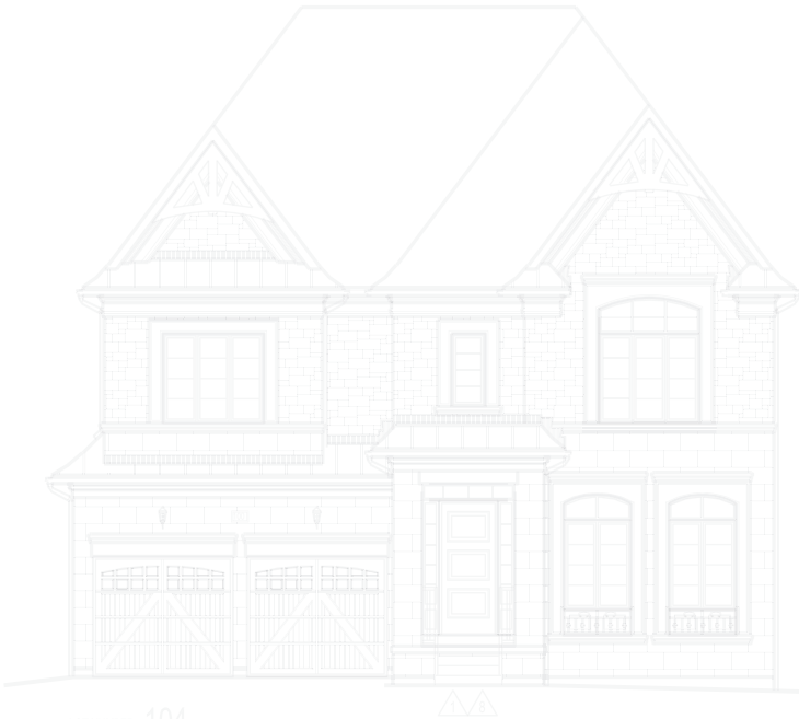
LOT NUMBER: 104 UNIT NAME: OAKGROVE ELEVATION: B (REV) UNIT NUMBER: 5003