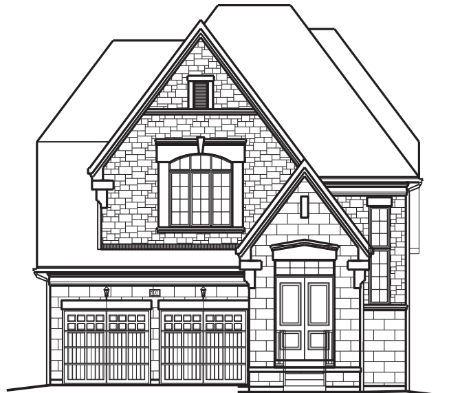
LOT NUMBER: 102 UNIT NAME: MAPLEWOOD ELEVATION: A (REV) UNIT NUMBER: 4201