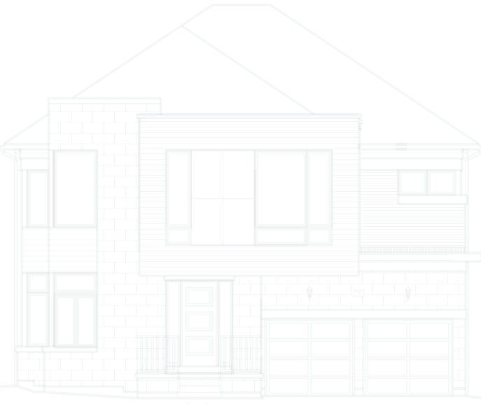
LOT NUMBER: 103 UNIT NAME: THE BEAUMONT ELEVATION: C UNIT NUMBER: 5004